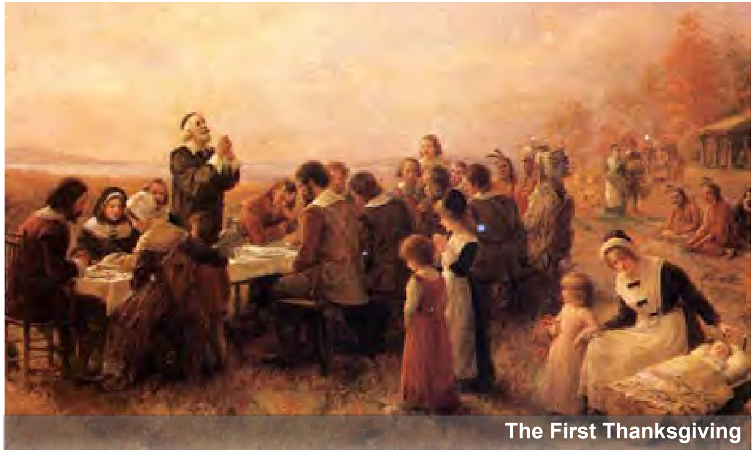
The First Thanksgiving