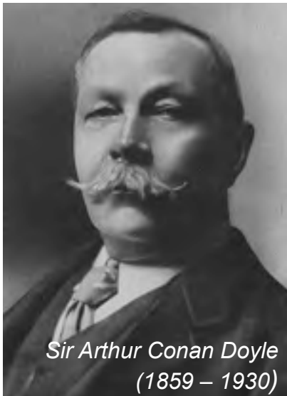
Sir Arthur Conan Doyle (1859 – 1930)