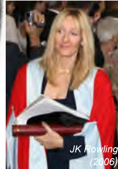
JK Rowling (2006)