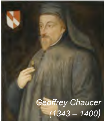
Geoffrey Chaucer (1343 – 1400)