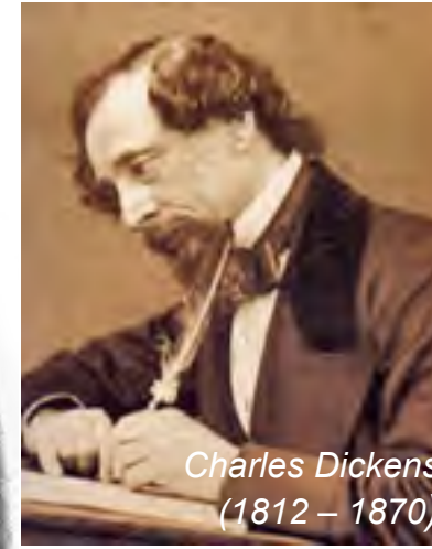
Charles Dickens (1812 – 1870)